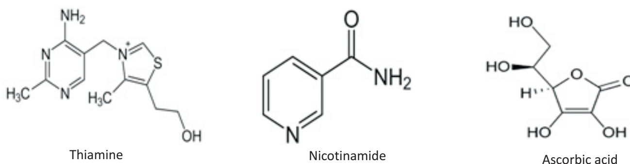
Figure 1: Structure of water soluble Vitamins

The purpose of the current study was to quantify some selected water soluble vitamins (Figure 1) including Thiamine (B1), Nicotinamide (B3) and ascorbic acids (Vitamin C) in some commonly available fruits in Lagos, Nigeria market employ Ascorbic acid HPLC coupled to a UV detector.